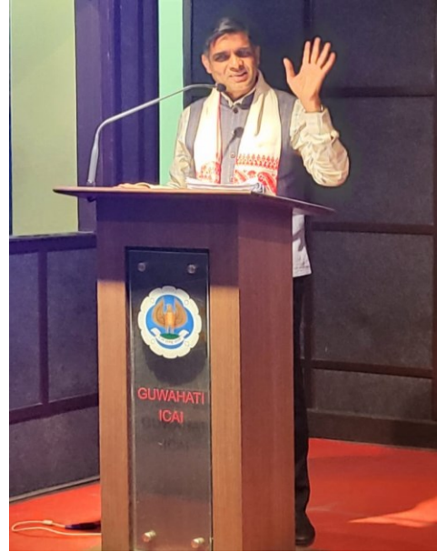
S. VAIDYANATH AIYAR MEMORIAL LECTURE ADVENT OF TECHNOLOGY IN AUDITS –16-02- 2023